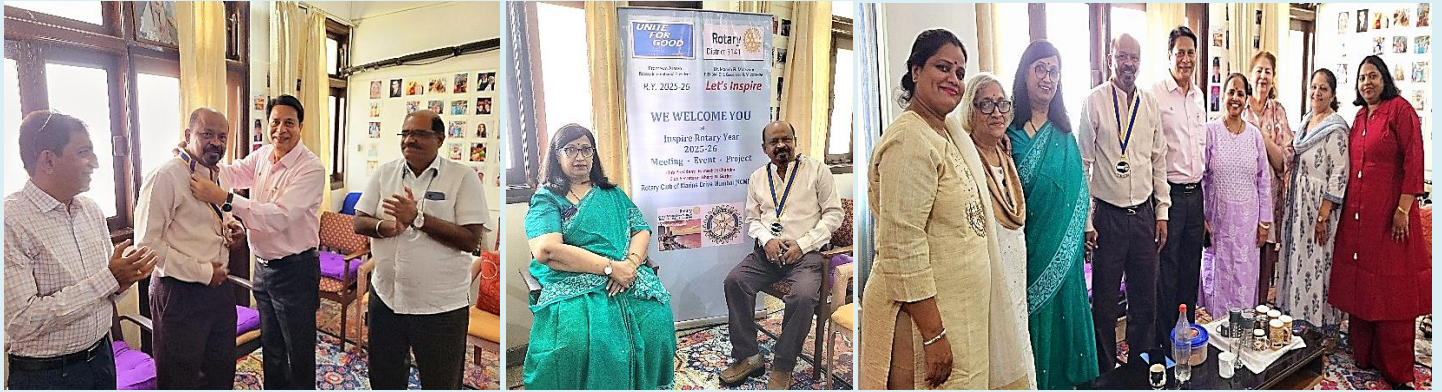
FIRST BOD Meeting of INSPIRE RY 2025-26 in progress. 21 BOD members of RCMDM attended.