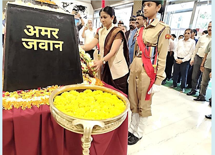
RCMDM members paying homage to the AMAR JAWAANS of Indian Defence Forces.