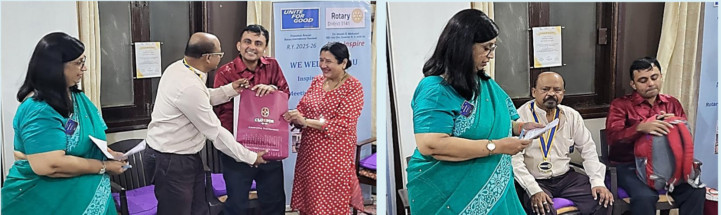
Cake cutting happened, after meeting was adjourned, celebrating birthdays and anniversaries happening in July 2025 and hard copy of the INSPIRE District Directory was handed over to each RCMDM member present at this meeting.