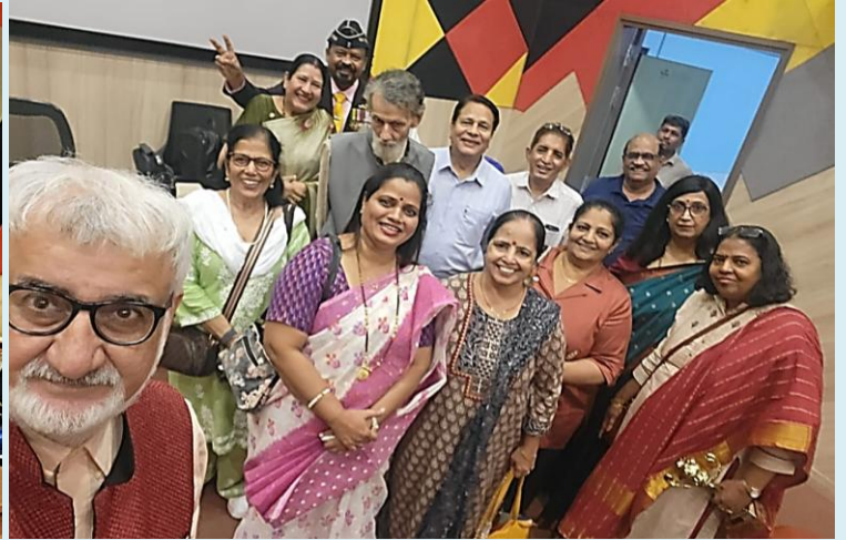
RCMDM members, partners and invitees in full participation and action

Venue: 4th Floor Auditorium, Thakur Shyamnarayan High School, Kandivali (East)