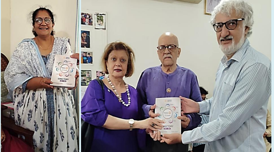
An enjoyable 1 st Meeting of Inspire RY-2025-26 which was followed by Spirited Dinner then followed by singing songs.

26.07.2025: RCMDM's 2nd Regular Meeting, Co-joined with the 2 nd Community Service event of Kargil Vijay Diwas Celebrations: