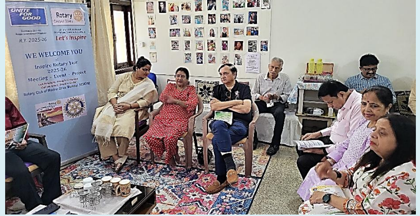
Audience in RAPT attention